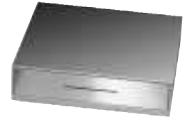
Media Slot Drawer